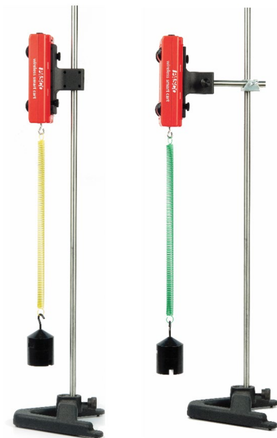
Figure 2. The Smart Cart can be mounted directly to a vertical rod (left) or to a horizontal cross-rod (right).