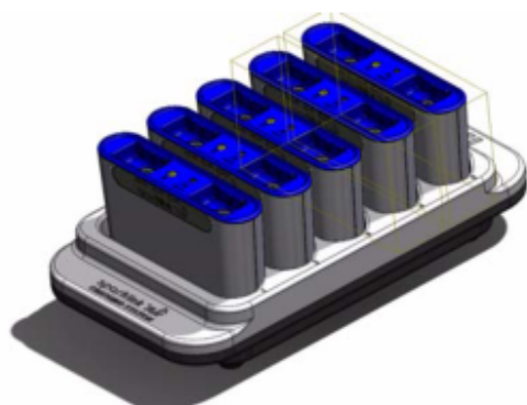
SPARKlink Air Charging Station with five SPARKlink Air's (not included)

SPARKlink Air Systems can be stored in the SPARKlink Air Charging Station for long periods of time without harming the battery. The SPARKlink Air circuitry monitors the battery level, and when it falls below a certain level, the circuitry will start charging the unit. When the battery is fully charged, the SPARKlink Air charging circuitry will stop charging the unit.